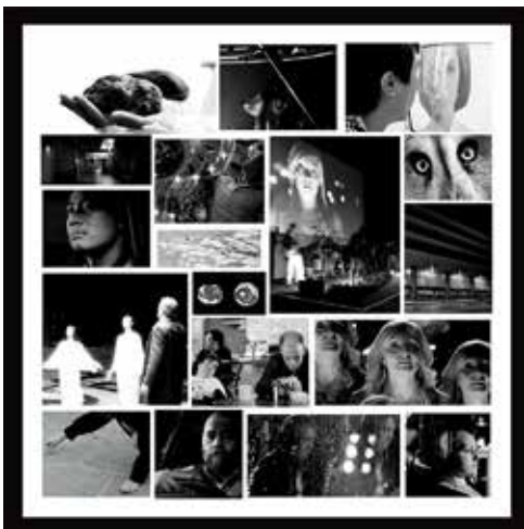
Inner Sleeve (front and back)

Download card insert: 140 gram black and white, 7 x 4 cm 40 Limited edition will also be sold with a unique screen print, numbered and signed by Shezad Dawood (not pictured)